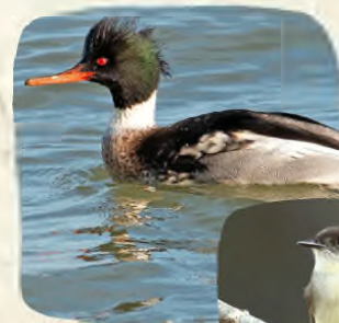
Red breasted merganser

There are many spring ephemerals--flowers that only bloom for a short time--to see here at the Pinnacles. The West Barton and Walnut Trails boast populations of flowers such as trout lily, Dutchman's breeches, toadshade, and rue anemone. Join us for a wildflower walk Saturday, March 27th at Anglin Falls at 5:00pm!