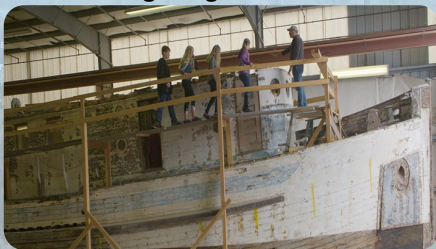
The beginnings of restoration

In 2019, Berea College became a part of the restoration journey of the historic purse seiner, the Western Flyer , built in Tacoma, Washington in 1937. John Steinbeck and Edward Ricketts completed a journey to the Sea of Cortez, which Steinbeck later wrote about in The Log from the Sea of Cortez . Over time, the book and the legend of the Western Flyer became famous with those who resonated with the messages of adventure and freedom.