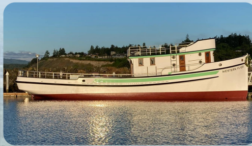
The Western Flyer after its recent launch

The Western Flyer Foundation acquired and began working to restore the vessel in 2015. Reconstruction of the boat's frame and "ribcage" required white oak lumber to be steam-bent, which the team sourced and found in the Berea College Forest. White oak trees require fertile soils and many years to grow to their full potential. Forest management practices at Berea allowed the trees used in this project, as well as in the construction of the Mayflower II , to grow to the height and width needed for projects such as these. Removing trees when they reach their peak allows the individuals around them to grow strong and healthy. The logs for the Flyer were extracted by horse logging, creating minimal disturbance to the environment. They were milled at a sawmill in Kentucky and shipped to Port Townsend, Washington.