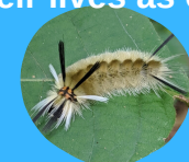
Banded Tussock Moth