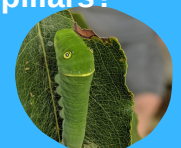
Eastern Tiger Swallowtail Butterfly

Caterpillars make a chrysalis that they live in while they change into a butterfly. Moth caterpillars make cocoons!